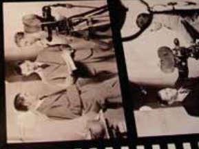
Burnaby Makes Movies exhibition