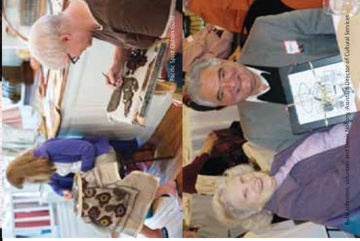
Pacific Spirit Quilts Guild