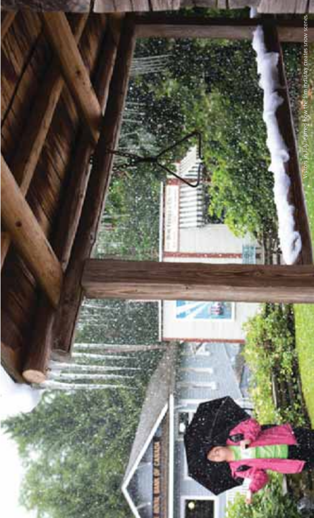
Visitors in July learned how the film industry creates snow scenes