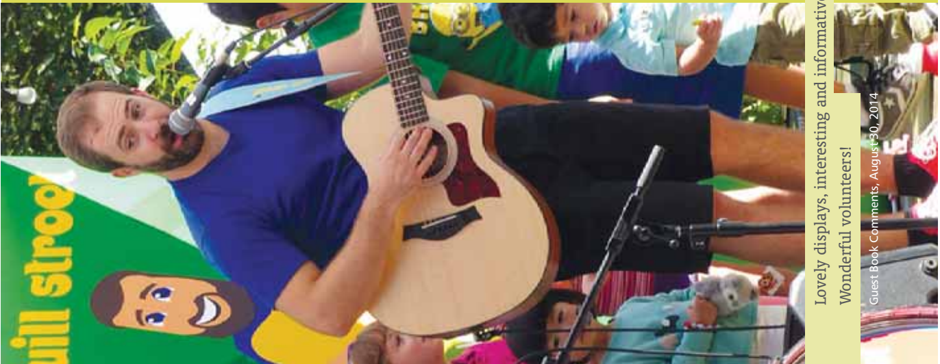
Lovely displays, interesting and informative. Wonderful volunteers!