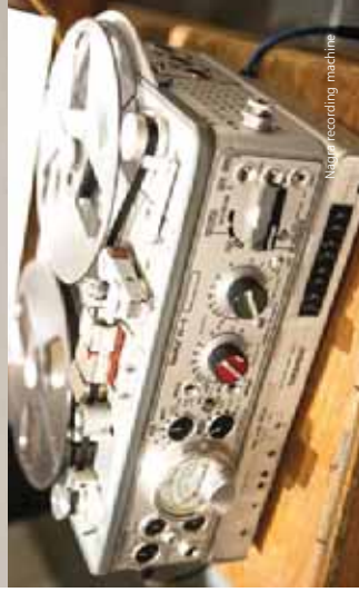
Nagra recording machine