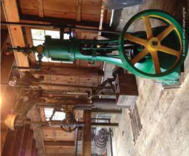
A restored vertical steam engine