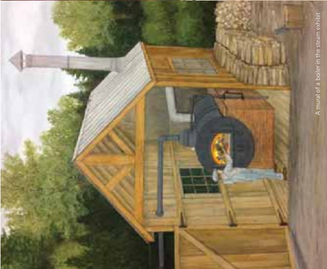
A mural of a boiler in the steam exhibit