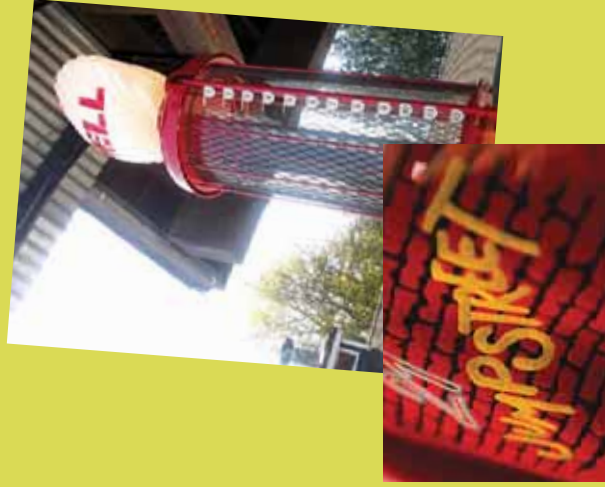
(right) Restored gas pump at the Royal Oak Garage

A display of metal objects, describing how different types of metal are made.